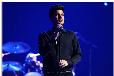
Adam Lambert performs in Las Vegas.

Like 34 Tweeted 547 G+ 28 Print 9 53 Comment 203 Email Print