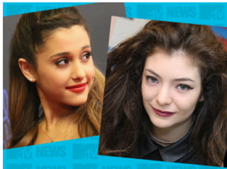
Ariana Grande & Lorde

With music from megastars like Justin Timberlake, Lady Gaga and Katy Perry coming fast and furious this fall, there's been no shortage of highly anticipated releases to look forward to. But even with so many heavy-hitters hitting on the charts, we couldn't help but notice a certain newbie holding strong with the vets: Last week, Lorde leaped to #1 on the Digital Songs chart with "Royals," topping even Katy.