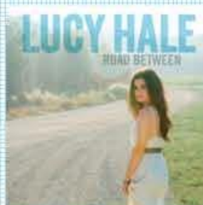
Lucy Hale Road Between (June 3)

Her buzzy sophomore album is finally here with "I'm Not a Girl" and "I'm Not a Boy".