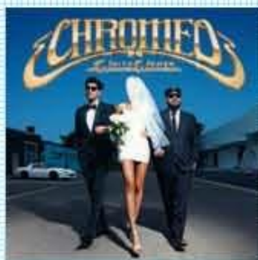
Chromeo White Women (May 12)

Whether you're hanging at the pool, hitting the road or getting ready to party, these picks are packed with catchy, feel-good anthems