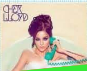
Cher Lloyd Sorry I'm Late (May 27)

The electro-pop duo is back with a new set of synth-y, energetic tunes, including one called "Solar".